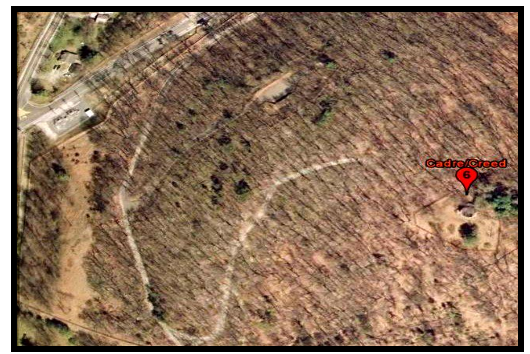
Google Earth View of Creed Tower on Raven Rock Mountain (2010)

Note: The tower today is abandoned and without any electricity to power the sump pumps the tower has flooded.