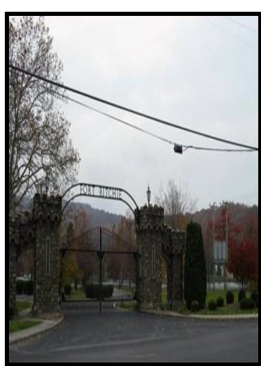
Ft Richie Parade field